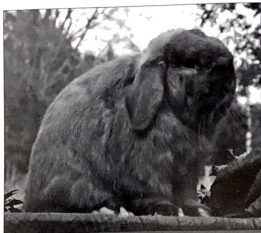
Lund Lops' Kermit SSB

In the coming years, I hope to continue the improvements of my herd. One day, I would like to be one of the breeders that the youth are able to look to for advice and guidance, like my mentors were for me. Moving forward with my herd in open, my goal is to one day have a herd strong enough to win Herdsman again.