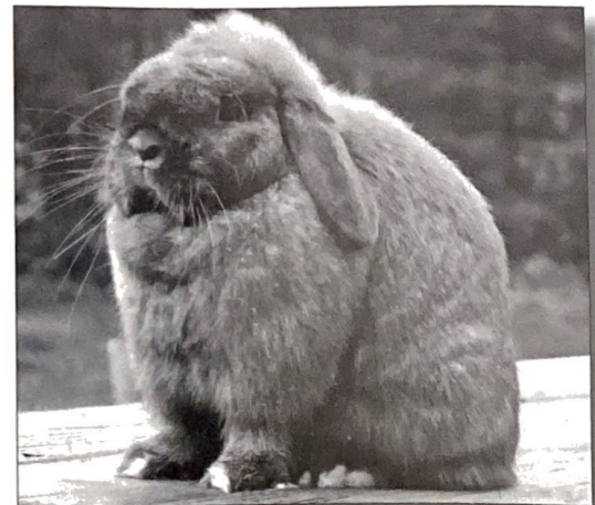
Lund Lops' Ruby SSD