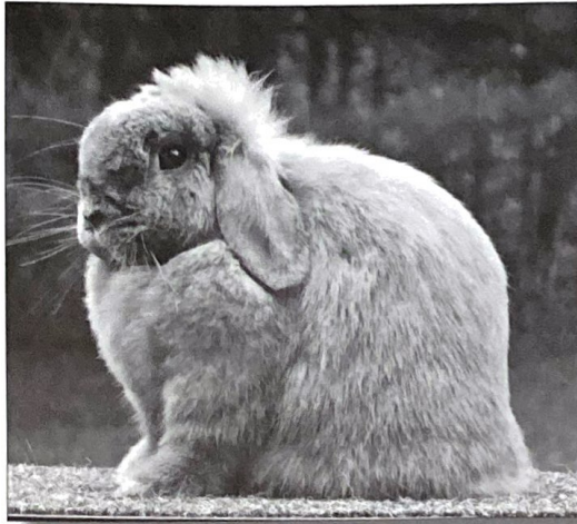
Lund Lops' Hoosier SSD