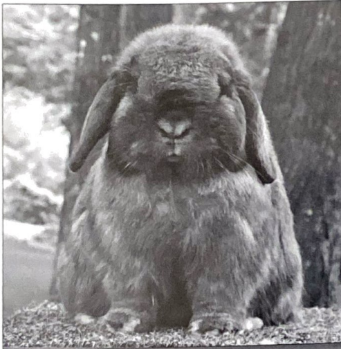
Lund Lops' Problem Child SSB

I couldn't be more pleased with the way my final year as a youth member played out. 2013 was full of hard work and watching my herd grow. Having the honors of being the Herdsman of the year once was incredible, and winning it for the second time is all the more humbling. I owe a lot of my herd's success to the breeders that have offered their years of expertise, and have advised me along the way.