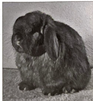
Brocks Fallen Ear's Romney