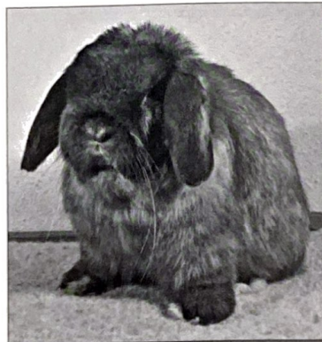
Brocks Fallen Ear's Talaisin