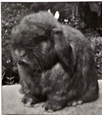
Brocks Fallen Ear's Maverick