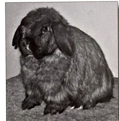
Brocks Fallen Ear's Tysha