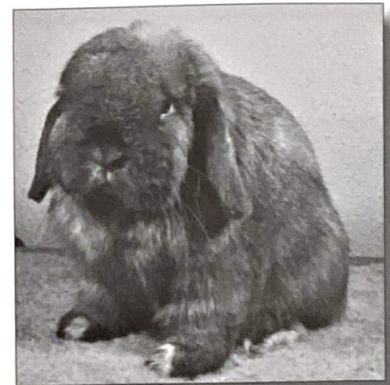
Brocks Fallen Ear's Tristan