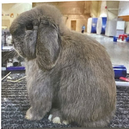
Boling Babies Boaz