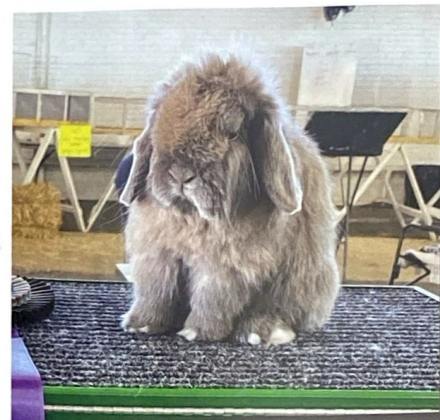
Boling Babies Hell Yeah