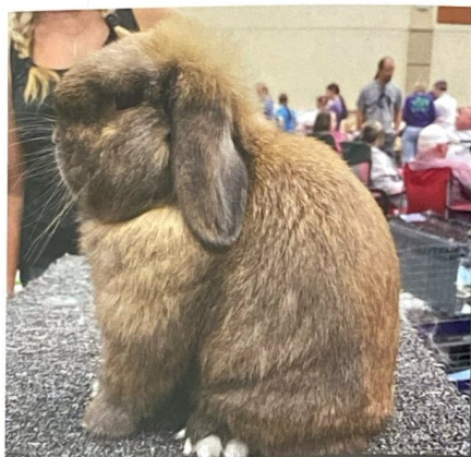
Quietcreek's City of Lights