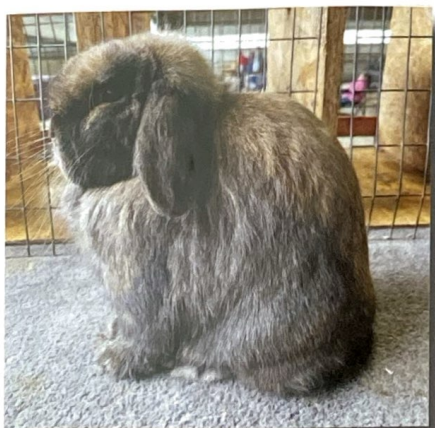
Boling Babies Ester