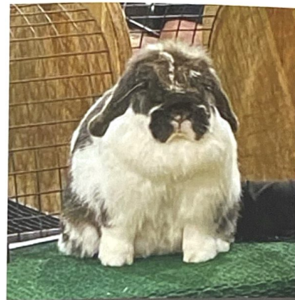
Quietcreek's Hearts Command