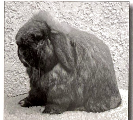
Brock's Fallen Ear's Sinatra