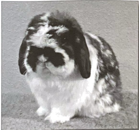
Brock's Fallen Ear's Carson

As I sit to write this, I am wondering what I haven't already said in the previous Herdsman articles.