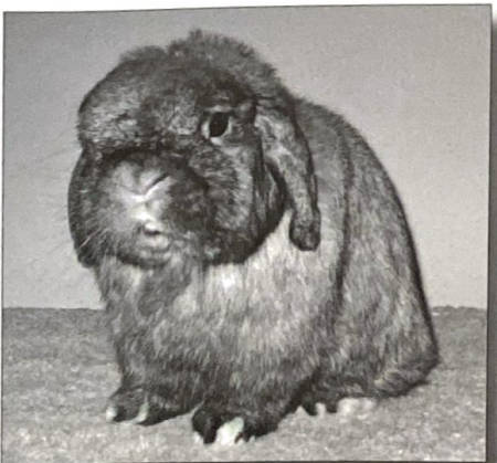
Brock's Fallen Ear's Colorado