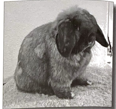
Brock's Fallen Ear's Jamboree