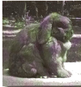
THF Saynora's Zweetums